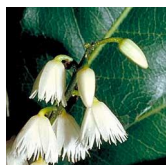
Blueberry Ash ( Elaeocarpus reticulatus )

The Blueberry Ash is a strikingly beautiful and hardy plant, which has many uses in a range of horticultural situations.