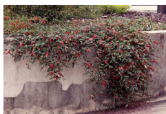
Grevillea Royal Mantle